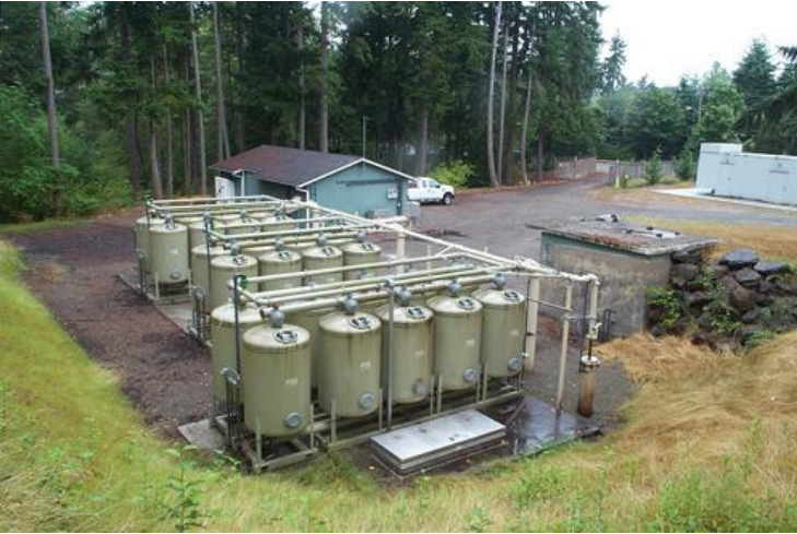
Well 17B, located at 320th/9th SW, with 26 filters which remove iron and manganese from the water.

Lakehaven Utility District has developed the capability of producing water from three deep aquifer wells drilled to a depth of over 100 feet below the ground surface (Wells 17B, 19, and 33). A Water Right Permit for these three wells was granted by the Department of Ecology a number of years ago; however, in order to complete the permitting process, the District will actually need to put the deep aquifer to beneficial use before a certificated water right is issued by the Department. The amount of water that can ultimately be utilized annually under the water right certificate depends on how much water the District can put to beneficial use over a twelve-month period from these sources. The twelve-month process of perfecting the water right began in January 2018. Our staff will be working diligently to keep these sources on-line and producing water day over the next year to maximize the water right. The supply from these sources will provide about 40% of the average daily water demand for our system.